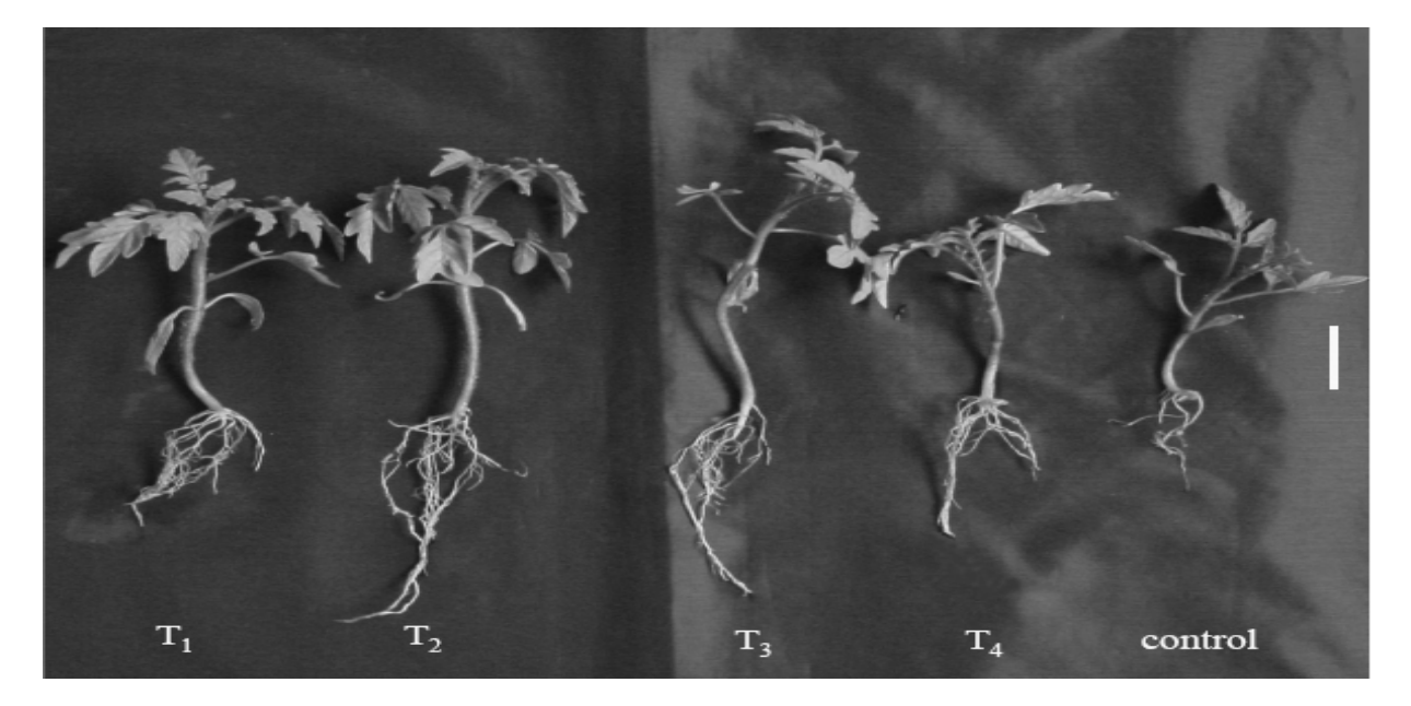
Fig 2. Photograph showing variation in growth due to different concentration of ozone treatments i.e. T_1 , T_2 , T_3 and T_4 compared to control plants, without ozone treatment. [Bar 2 cm] A minimum of 30 explants were cultured for each treatment and each experiment was repeated thrice. Where, T_1 = 0.1 ppm, T_2 = 0.2 ppm, T_3 = 0.3 ppm, T_4 = 0.4 ppm of ozone passed for a time period of 2 min a day continuously for 10days (i.e. O<sub>3</sub> treatment duration was standardized as 2min repeatedly for 10 days) and for the control (C) treatment, ambient air was passed.

of other organs. During leaf expansion, a wave of ROS-dependent cell growth sweeps through the leaf (Rodriguez et al., 2002) This suggests that the rate of cell growth may be proportional to the amount of ROS produced in growing organs, but in contrast higher O<sub>3</sub> concentration affects the plant severely. The mechanism by which ROS action these different facets of development remains mysterious, but unraveling them will provide important insights into the mechanism by which ROS controls development. The cell wall plays an important role in cell expansion; loosening the wall allows cells to expand, whereas wall cross-linking can inhibit expansion. There is evidence that ROS are involved in both processes. They have been implicated in the loosening of cell walls in growing tissues (Liszkay et al., 2004) and in making cell walls stiff as growth ceases and cells differentiate (Ros- Barcelo et al., 2002).